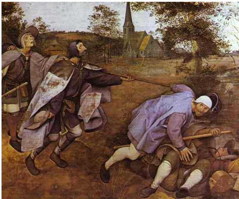
Bruegel, Parable of the Blind Leading the Blind , 1568

Fourth Sunday after Trinity 13 July 2025